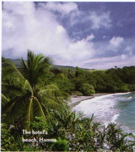
The hotel's beach, Hana.