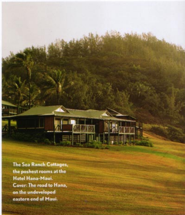
The Sea Ranch Cottages, the poshest rooms at the Hotel Hana-Maui. Cover: The road to Hana, on the undeveloped eastern end of Maui.

All of the Hawaiian songs sounded much the same to a mainland's ear, except for one. The Dawning—Ke Alaula —was a pop