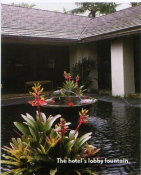
The hotel's lobby fountain.

I'd never seen colors quite like his. The greenish yellow of bamboo, the reddish orange of volcanic earth, the fresh green of new tropical foliage, the particular blue of the Pacific—such Hawaiian colors. Conrad designed all the new teak furniture, not highly polished but rough-hewn and even cracked, as well as bedspreads with the feel of bark cloth and curtains with traditional kapa patterns. You read yourself to sleep propped against a headboard of padded raffia, and walk around your room barefoot on lauhala mats. Some of the details are simply amazing: the bathroom sconces have shades made of young-